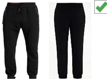
Plain black sweatshirt material